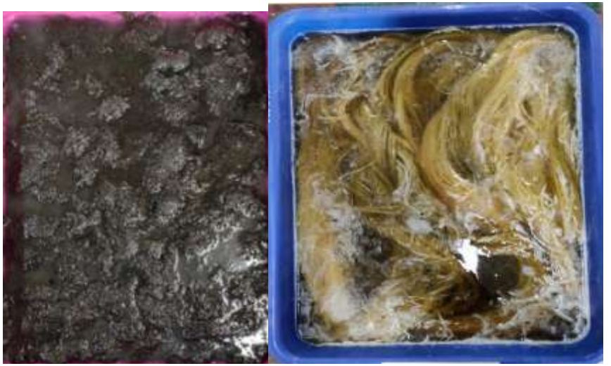
fig.5: human hair with 10% NaOH