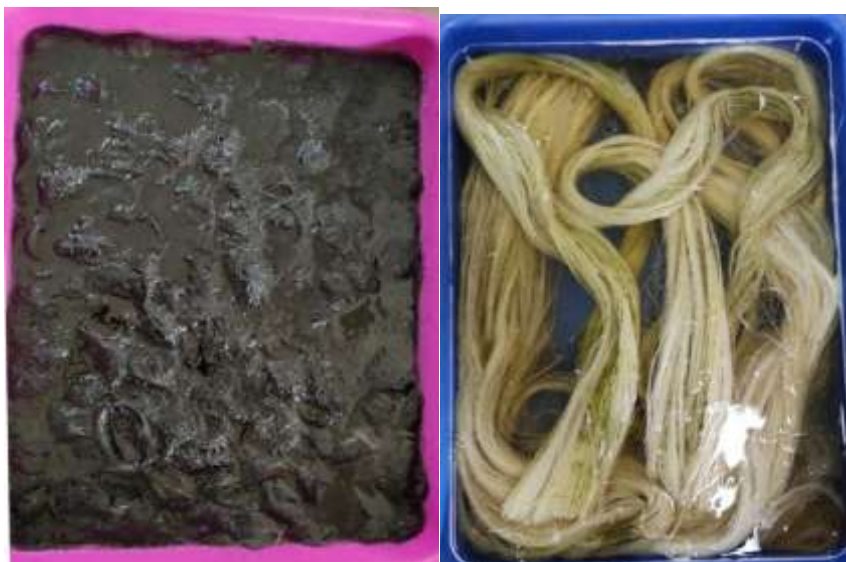
Fig.3: human hair in water

Volume 3, Issue 7 July 2021, pp: 802-808 www.ijaem.net ISSN: 2395-5252