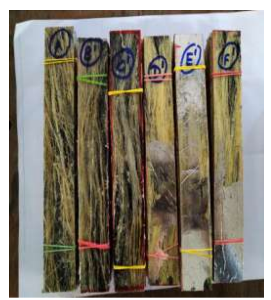
Fig 7: Final products cutted into strips