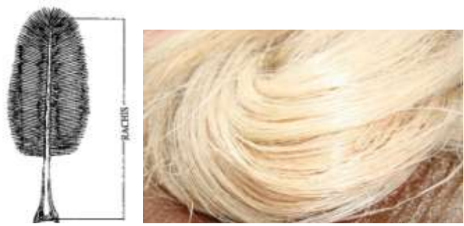
Fig.2.1 Coconut leaf midrib (rachis) Fig 2.2Coconut fibre obtain from midrib (rachis)

cellulose and 16% lignin which use for reinforcement of the different strucutral parts where moderate strength is required like door ,panel,roof ,sheets, packaging etc. The extraction of fiber done by soaking of Coconut leafs in water about 3days ,which loosen and are separated from the leaf by using metal wise brush and fibers are dried in room tempertaure,this fibres are known as untreated fibres.this fibres we are using for reinforcement of composite materials.